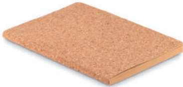
Notecork MO9860 A5 notebook 96 lined sheets with cork soft cover.