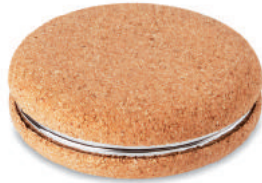
Guapa Cork MO9799 Rounded double sided compact mirror with cork finish cover.