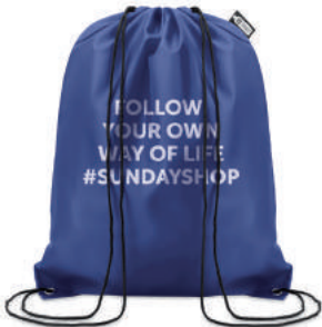
Shooppet MO9440 Drawstring bag in 190T RPET with PP strings.