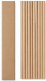
Paper Straw MO9795 Set of 10 paper straws presented in a Kraft box.