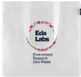
Tote Pla MO9878 PLA corn non woven shopping bag with long handles.