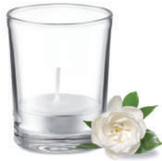
Transparent MO9734 Fragranced small candle in transparent glass holder with coloured tea light.