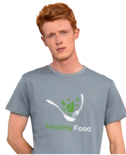
Inspire T BC0102 140 g/m², 100% cotton (organic), combed and ring-spun.