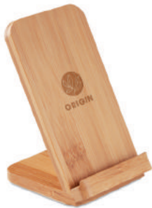
Wire&Stand MO9692 Double coil wireless charger for 1 device in bamboo casing and with stand functionality.