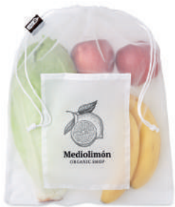
Veggie Rpet MO9880 Food bag in mesh RPET with front pocket and drawstring cord.