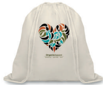
Organic Hundred MO8974 Organic cotton drawstring bag in 105 gr/m².