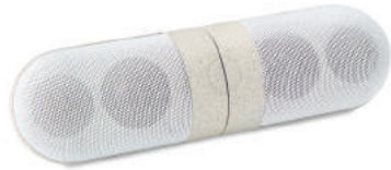
Soul MO9757 Set of 2 magnetic Bluetooth 5.0 speakers in 30% wheat straw and 70% ABS material .