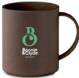
Brazil Mug MO6107

Single wall tumbler in 50% coffee husk and 50% PP.