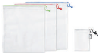
yc Veggie Set Rpet MO9898 Set of 3 RPET mesh bags in RPET pouch. Reusable fruit or vegetable bags.