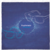
Rpet Cloth MO9902 RPET cleaning cloth For cleaning a screen.