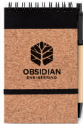
Sonoracork MO9857 A6 Cork cover notebook with 70 pages of lined recycled paper.