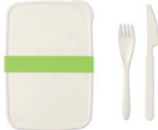
Nan Box MO6103 Lunchbox made of 20% bamboo fibre and 80% PLA corn with silicone band.