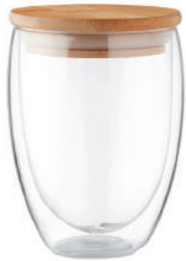
Tirana Medium MO9720 Double wall high borosilicate glass with bamboo lid with silicone ring. Capacity 350 ml. As bamboo is a natural material, the colour per item can vary.