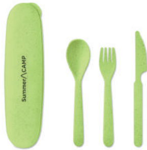
Siya MO9744 Re-usable cutlery set made of 50% wheat straw and 50% PP.