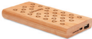
Arena MO9662 Wireless charging and power bank with 6000 mAh capacity in Bamboo casing.