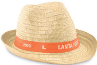
Boogie MO9341 Paper straw hat with coloured polyester band.