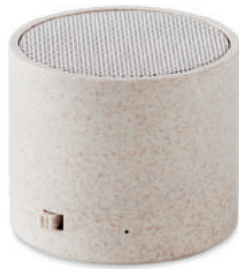
Round Bass+ MO9995 5.0 Bluetooth speaker in wheat straw (35%) and ABS(65%) and LED light indication.