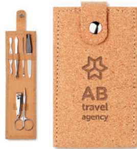
Nailkit Cork MO9798 6 piece stainless steel manicure set in rectangular cork pouch.