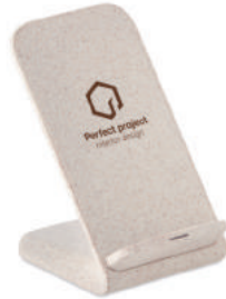
yc Layaback MO9891 Double coil wireless charger stand. 35% wheat straw and 65% ABS.