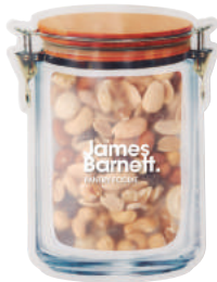
Pot Food MO9784 Small eco-friendly, easy seal, leak proof and reusable stand up food storage bag.