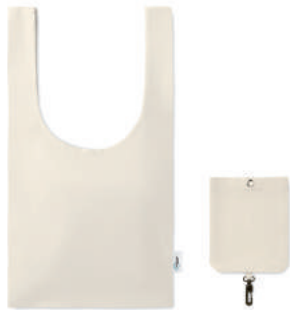
Fold-It-Up MO9749 Large foldable shopping bag in recycled fabrics 150 gr/m². 55% RPET and 45% cotton.