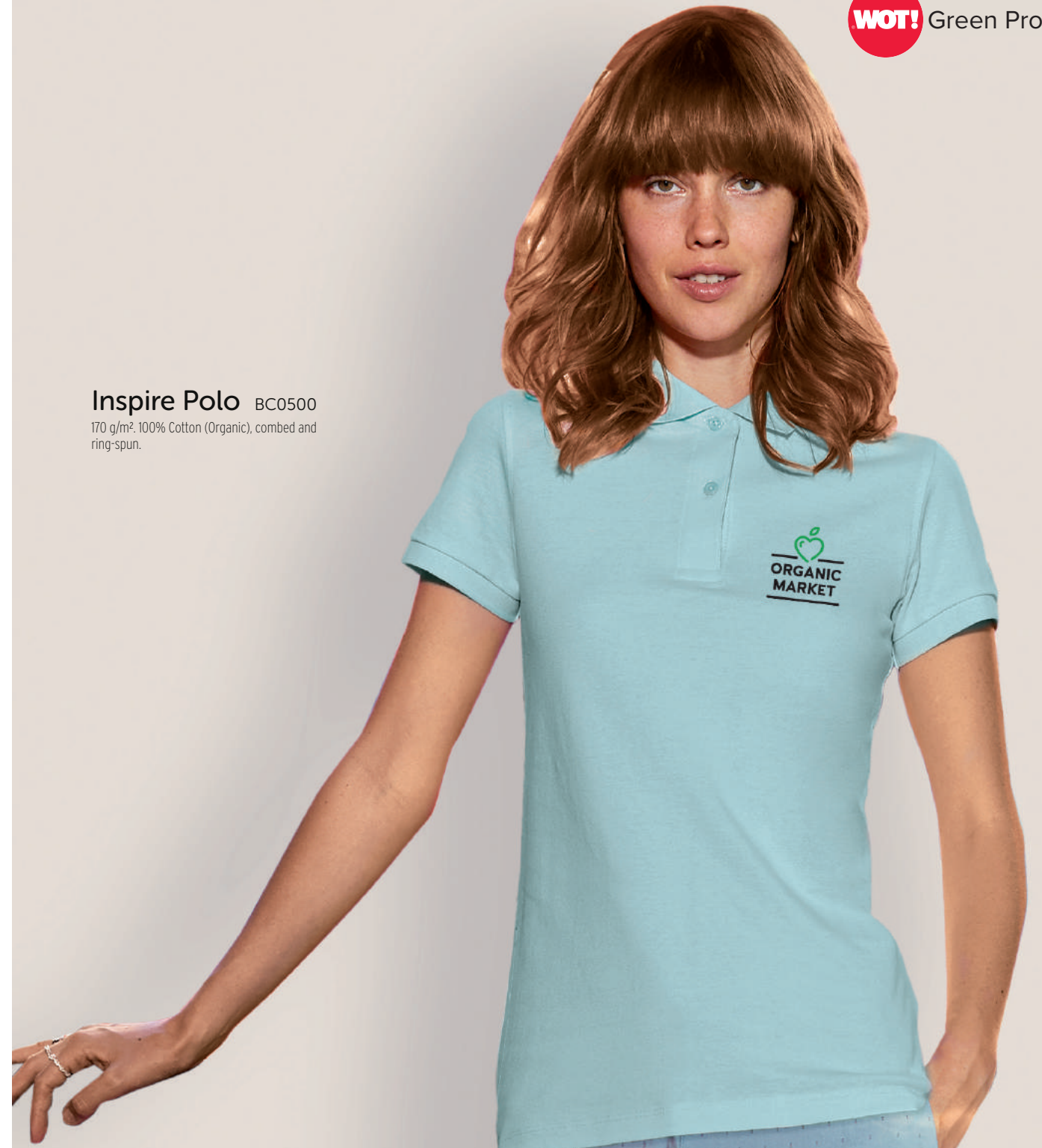
Inspire Polo BC0500 170 g/m², 100% Cotton (Organic), combed and ring-spun.