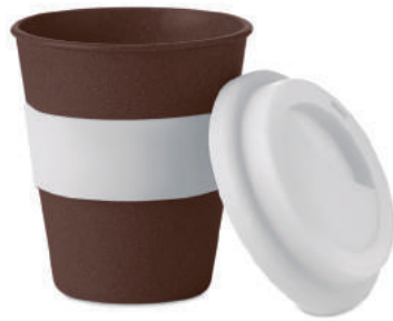
Brazil White MO6106

Single wall tumbler in 50% coffee husk and 50% PP.