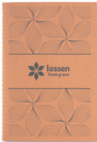
Mid Paper Book MO9867 A5 Cardboard cover (250gr/m²) notebook.