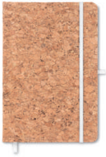
Suber MO9623 A5 notebook 96 lined paper with cork cover.