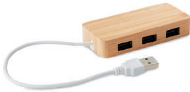
Vina MO9738 3 port 2.0 USB hub in bamboo case. Cable length 18,5 cm.