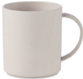
Nan Mug MO6105 Single wall mug made of 20% bamboo fibre and 80% PLA corn. Capacity: 300 ml.