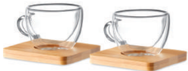
Belize MO9709 Set of 2 double wall espresso glasses with bamboo saucer.