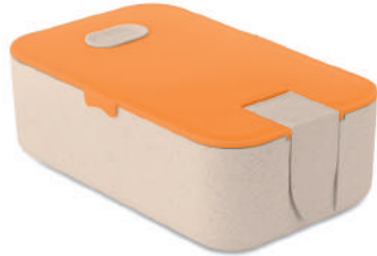
Lunch2Go MO9739 Lunchbox made of 50% wheat straw fibre and 50% PP body.