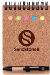
Multicork MO9856 Cork cover ring notebook containing 5 sticky multi-coloured tabs and memo pad of 25 sheets.