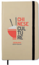
Evernote MO7431 A6 Notebook in recycled material with matching colourful ribbon and elastic band.