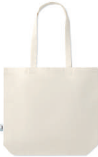
Zigzag MO9750 Foldable shopping bag in recycled fabrics 150 gr/m². 55% RPET and 45% cotton.