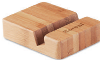
Apoya MO9693 Smartphone stand in bamboo.