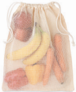
Veggie MO9865 Re-usable food bag. One side is in cotton (140gr/m²) and other one is in mesh cotton (110gr/m²).