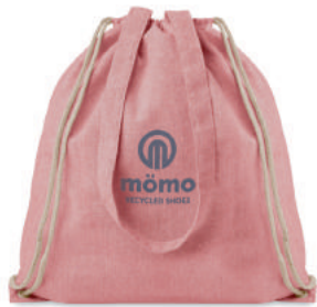
Moira Duo MO9603 2 tone recycled cotton and recycled polyester shopping bag with drawstring and long handles.