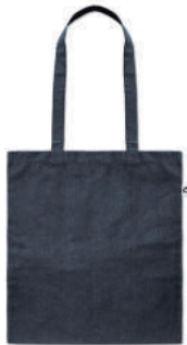
Cottonel Duo MO9424 2 tone recycled cotton and recycled polyester shopping bag with long handles.