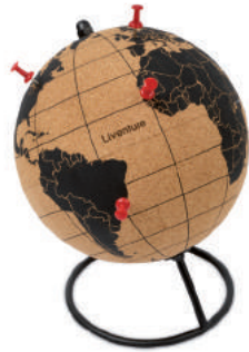
Pinpoint MO9722 Globe in cork material with stand and 12 pins.