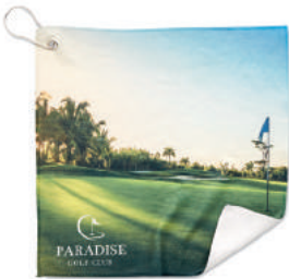
yc MPGT12 Golf towels in 100% RPET.