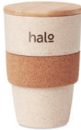
Lanka MO9896 Single wall tumbler in 65% PLA corn and 35% wheat straw with bamboo lid and cork grip.