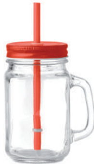
Tropical Twist MO9565 Mason jar glass with handle and tin lid. Includes a PP straw.