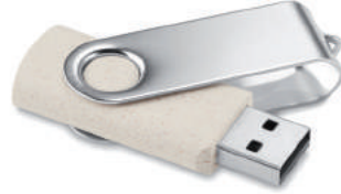
yc Techmate+ MO9871 Wheat straw PP 50/50 USB 16GB