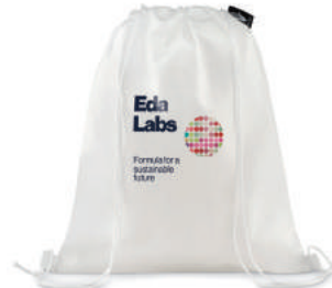
Daffy Pla MO9879 PLA corn non woven drawstring bag.