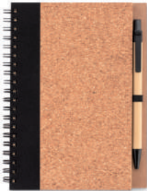
Sonora Pluscork MO9859 Cork cover notebook with 70 pages of lined recycled paper.