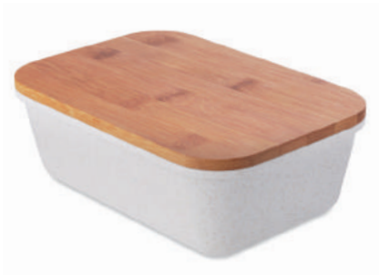
Fancy Lunch MO9740 Lunch or sandwich box in 50% bamboo fibre and 50% PP.