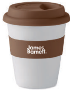
Nan MO6104 Single wall tumbler in 100% PLA corn with silicone lid and grip. Capacity: 350 ml.