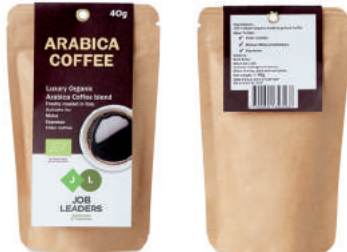
Arabica 40 MO9724

Organic Arabica coffee powder. Freshly roasted in Italy.