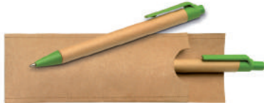
Greenset MO7620 Paper barrel pen set.