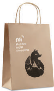
Paper Medium MO8808 Medium Gift paper bag. 150 gr/m².