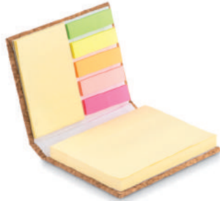
Visioncork MO9855 Cork cover sticky note-pads.