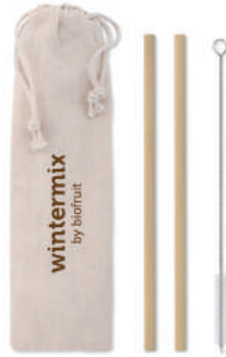
Natural Straw MO9630 Set of 2 reusable bamboo straws , stainless steel-nylon cleaning brush in cotton pouch.