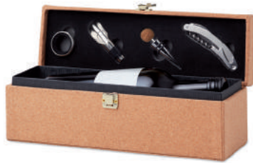
Otago MO9717 Wine set in cork laminated gift box with space for one wine bottle.