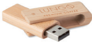
yC MO1202 USB 16GB Bamboo.