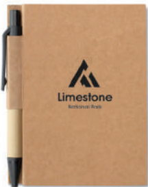
Cartopad MO7626 Compact memo/notebook with pen in recycled material.