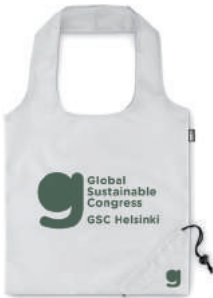
Foldpet MO9861 Foldable shopping bag in 190T RPET with drawstring closure on pouch.