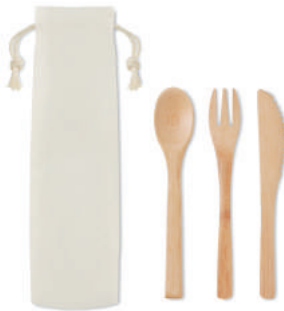
Setboo MO9786 Re-usable bamboo cutlery set in canvas pouch. Includes knife, fork and spoon.