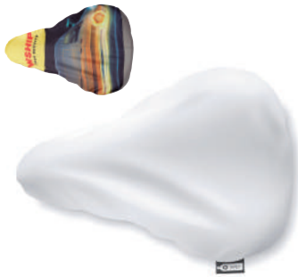
Bypro Rpet MO9908 Saddle cover for bicycle made in RPET. MPSC01 Bypro Fully Customised.