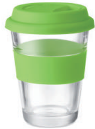
Astoglass MO9992 Glass tumbler with silicone lid and grip. Capacity 350 ml. As this is a single wall mug heat transfer can still occur.