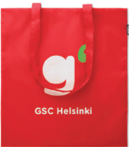
Totepet MO9441 Shopping bag in 190T RPET with long handles. 100 gr/m².