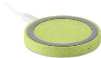
Plato+ MO9996 Wireless charger in wheat straw (35%) and ABS (65%).