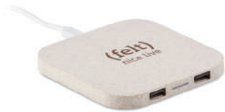
Unipad+ MO9997 Wireless charging pad in wheat straw (35%) and ABS (65%) with 2 port 2.0 USB hubs.