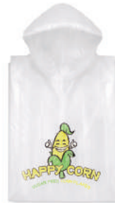
yc Sprinkle Pla MP0015-PLA Biodegradable poncho and bag fittings.