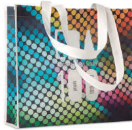
yc PLA fully customised MO4970 Full customization: edge-to-edge full colour printed designs and custom sizes.