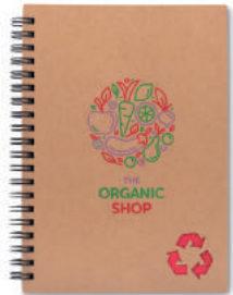
Piedra MO9536 Ring notebook, 70 sheet lined stone paper and recycled carton cover.