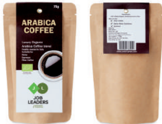
Arabica 75 MO9725

Push button paper barrel ball pen with parts made of 40% coffee husk and 60% ABS.