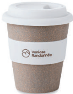
Astoria+ MO8547 Single wall tumbler in 50% bamboo fibre and 50% PP with silicone lid and grip.