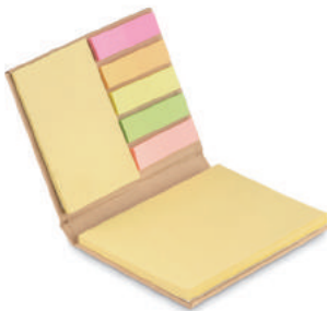
Recyclo MO7173 Multi size sticky note-pads in strong recycled carton.