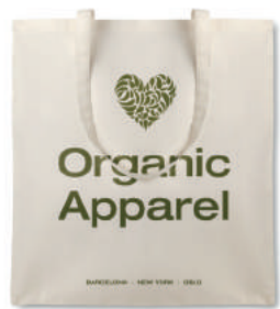
Organic Cottonel MO8973 Organic cotton shopping bag with long handles. 105 gr/m².