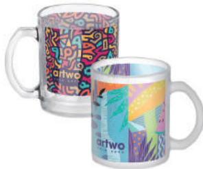
Sublimatt MO6117 Matt glass mug 300 ml capacity with special coating for sublimation.