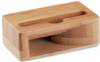
Caracol MO9706 Smartphone stand and amplifier in bamboo material.