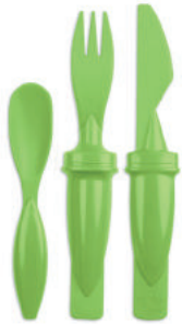
Chin Set MO9802 Re-usable cutlery set made of 50% bamboo fibre and 50% PP.