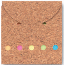
Foldcork MO9858 Cork memo pad 125 yellow pages with 5x25 sticky multi-coloured tabs.